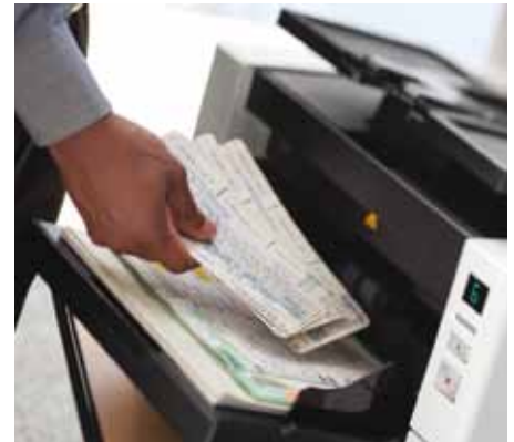
SurePath Paper Handling automatically adjusts for a variety of document sizes and thicknesses.

Smallest scanner in its class to offer a 500-sheet input capacity.